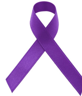
October is Domestic Violence Awareness Month